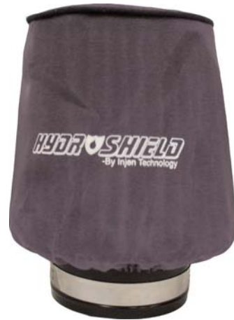
Hydro Shield sold separately